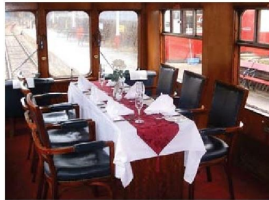
The interior of the private saloon

Refreshments are normally available at Wirksworth Station on operating days in our buffet car, which is open to the public and to passengers. Refreshments include teas, coffees, sandwiches, cakes and other items.