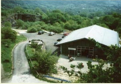
The National Stone Centre seen from the High Peak Trail

Some nine miles from Duffield is Ravenstor platform, our station for the High Peak Trail, the National Stone Centre, the Derbyshire Eco-Centre, Black Rocks Picnic Area, Middleton Top Visitor Centre and the Steeple Grange narrow gauge railway. There are many fine walks up to and along the High Peak Trail and around the villages of Middleton by Wirksworth and Bolehill, which are nearby.