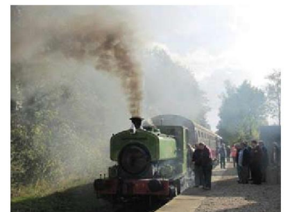
Engine number 3 steams up

December 10th and 11th also 17th and 18th Santa Trains at Wirksworth Station. Join Santa and his helpers for a festive time. Presents and drinks for the kids, Mulled wine and mince pies for adults. Advanced booking is essential. Tickets will be sent out on receipt of the advanced booking form (available from the station) or on our website www.e-v-r.com