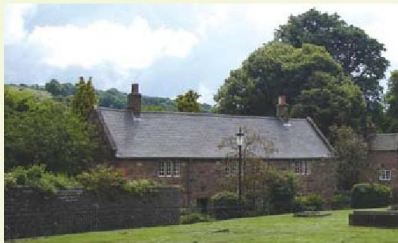
The Almshouses, Wirksworth

Pendleton's History of Derbyshire says: "Even more picturesque than Ashbourne is Wirksworth, with its irregular streets, odd nooks and corners, and houses dusky with age. Lying in a quiet fertile valley, edged about with great limestone rocks... in comfortable contented serenity."