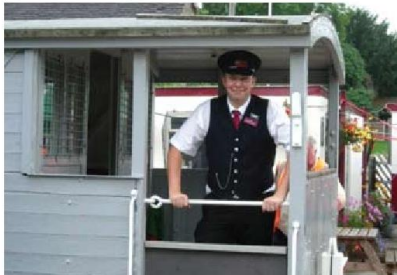
A friendly welcome

April 29th, 30th, May 1st and 2nd Bank Holiday Open Days at Wirksworth Station. Adults £12.00; Concessions £10.00; Children £6.00; Families (2+3) £29.00. Both the Ravenstor and Duffield lines will be in operation. There will be steam trains on the Duffield line behind our visiting steam locomotive. There will be a pre-bookable guided walk "Rails and Quarries of Wirksworth" on the 30th April (12.30 start, £3.00, phone 01629 823076). Open 10.00 am to 5.00 pm each day.