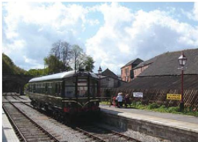
A restful pause at Wirksworth

On Special Events Days extra trains will operate in addition to the above services. Special Fares apply on events days