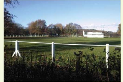
Duffield Eyes Meadow by the river

Now a large village, Duffield lies mainly around the banks of the River Ecclesbourne. It was mentioned in Domesday Book and once there was a great castle here, a seat of the de Ferrers, Norman lords of the manors of Wirksworth and Ashbourne, and Earls of Derby. The castle site, now a grassy mound, is looked after by the National Trust and can be found a short walk from the station.